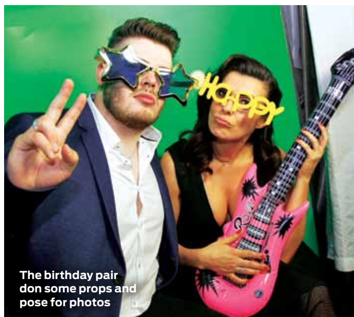
The birthday pair don some props and pose for photos

Your pal Alison King has spread her wings and left the show. Would you like to try your hand at other roles?